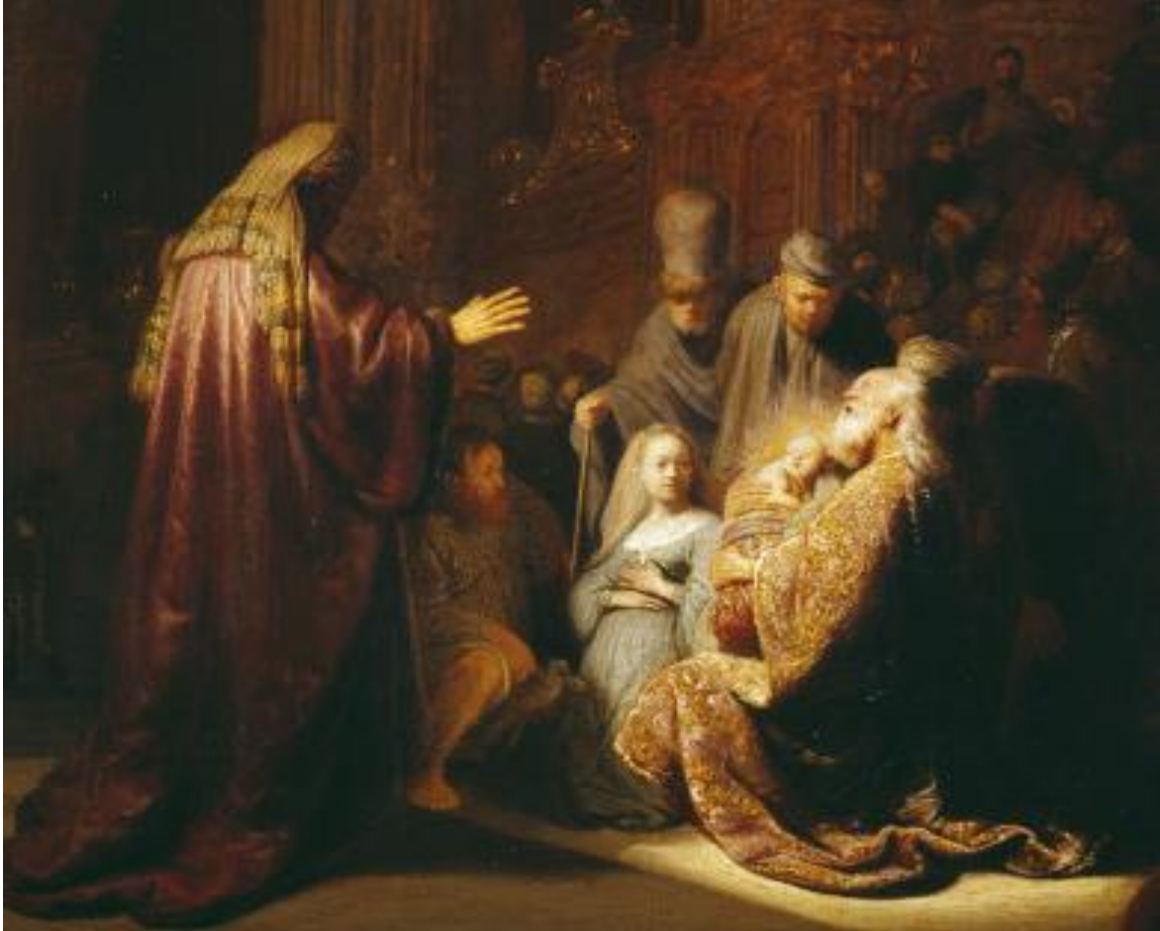
The Presentation in the Temple, Rembrandt van Rijn 1606-69

The Parish and Ward Church of St Botolph-without-Bishopsgate in the City of London EC2M 3TL