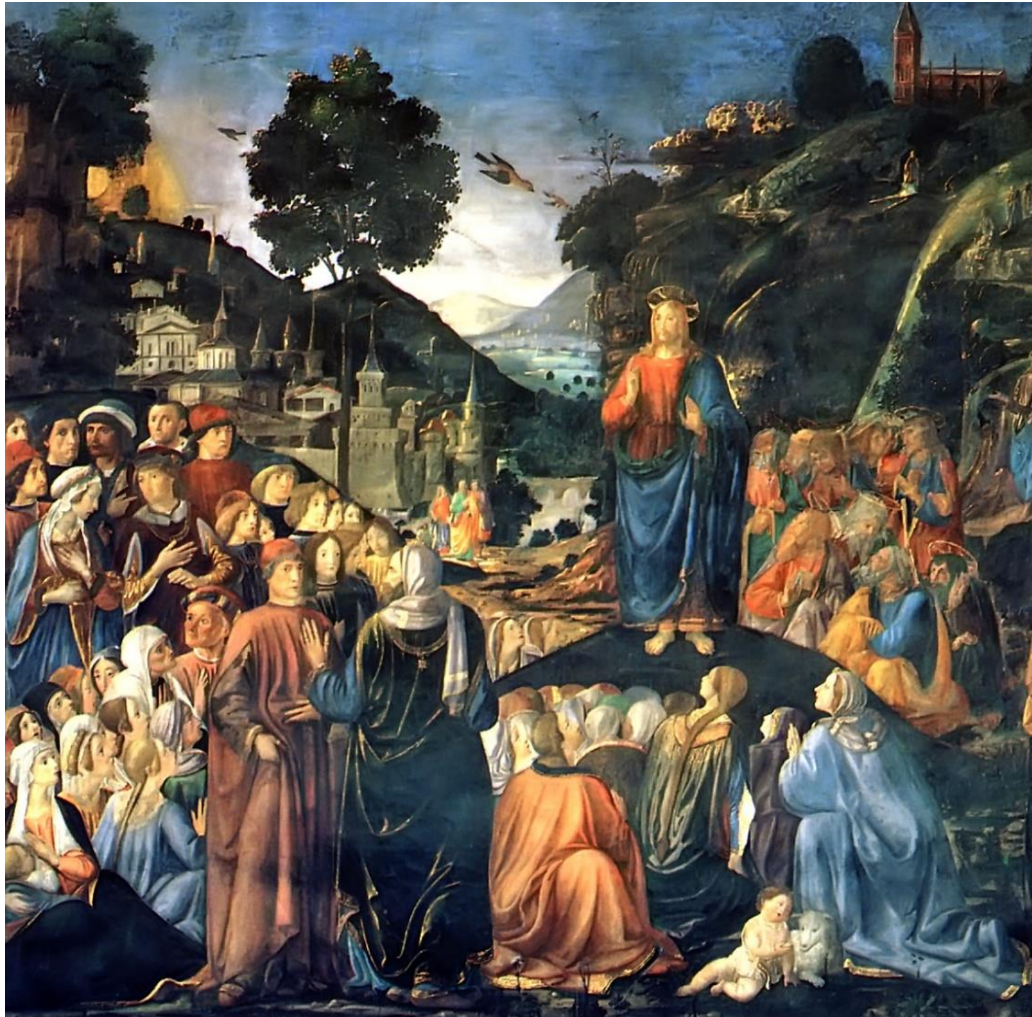
The Sermon on the Plain, 1481-2, Cappella Sistina, Vatican