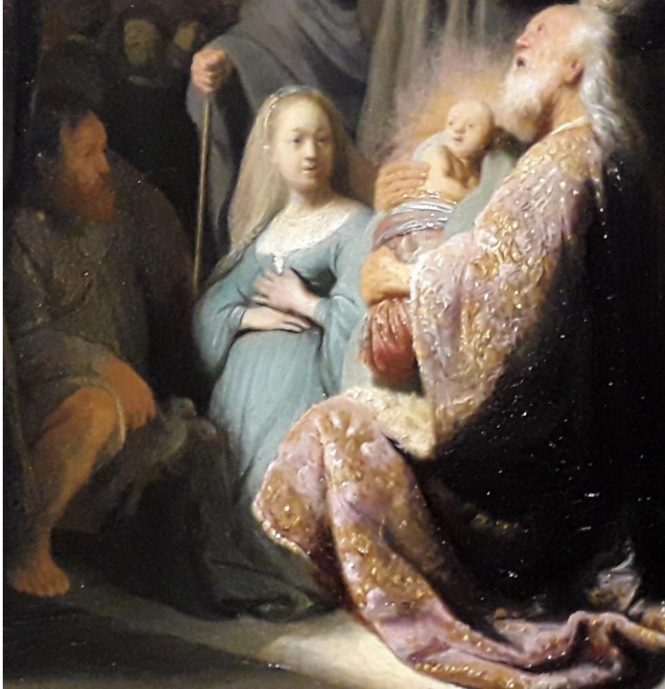
The Presentation in the Temple (detail), Rembrandt van Rijn 1606-69

The Parish and Ward Church of St Botolph-without-Bishopsgate in the City of London EC2M 3TL