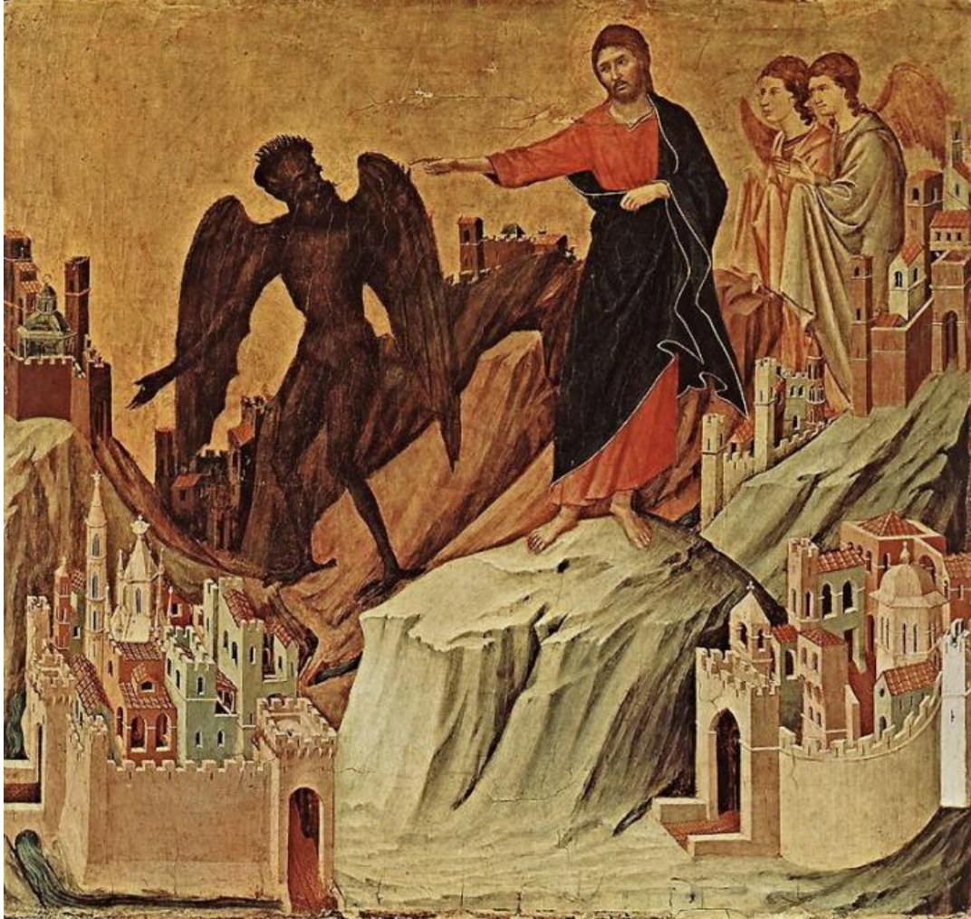
The Temptation of Christ on the Mountain, Duccio di Buoninsegna c.1310 (Frick Collection, New York)