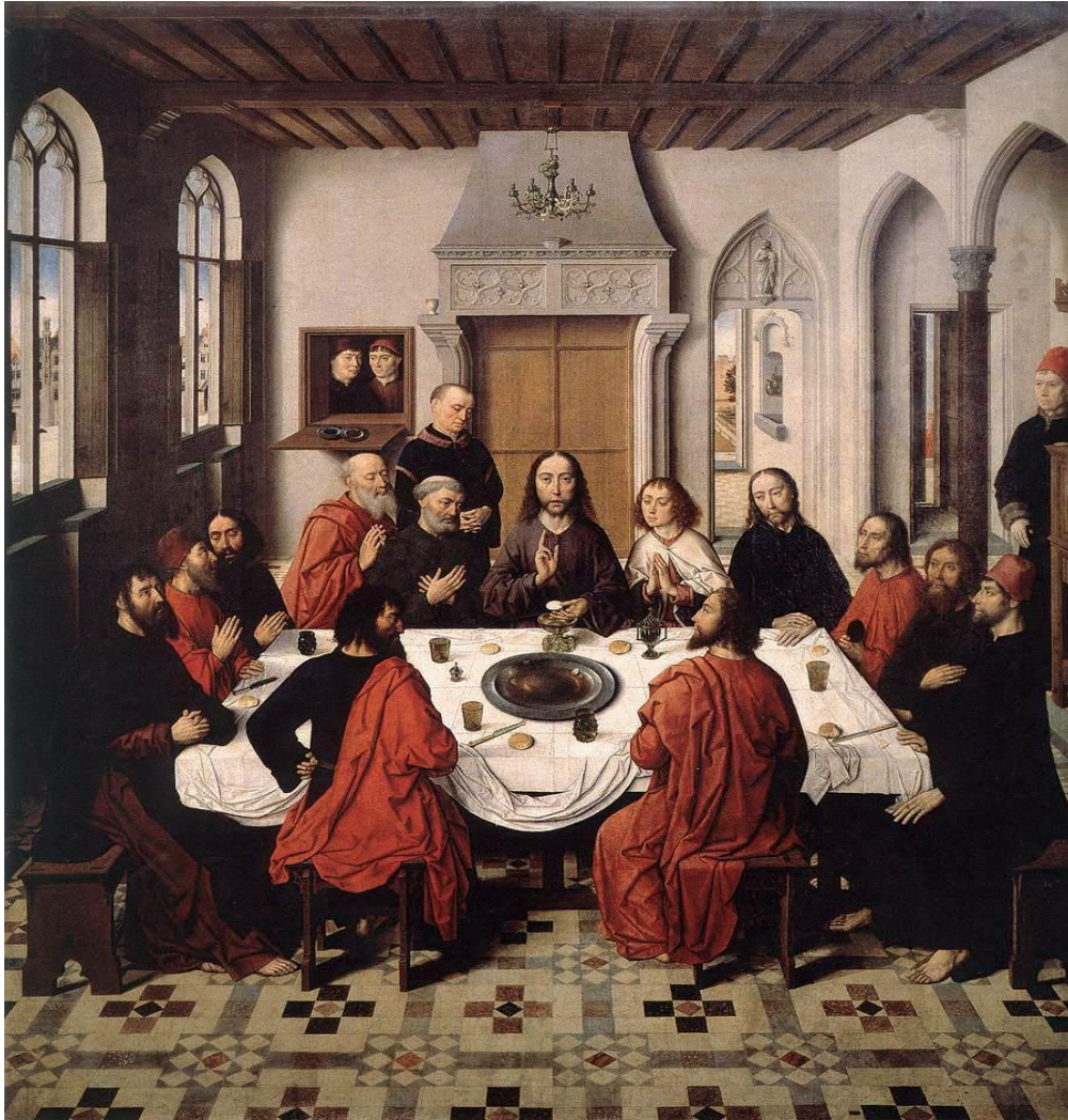
The Last Supper, Dieric Bouts c1415-75, Sint Pieterskerk, Leuven