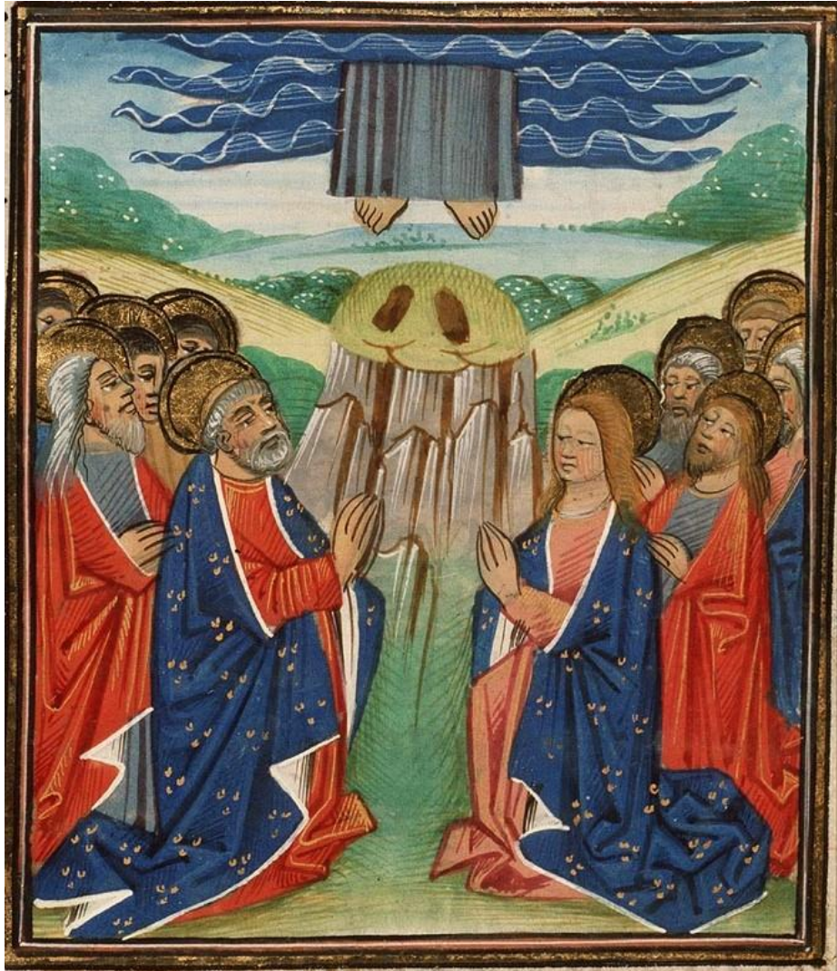
MS illumination, Flemish (Bruges), c.1455-1460 The Hague, Koninklijk Bibliotheek

The Parish and Ward Church of St Botolph-without-Bishopsgate in the City of London EC2M 3TL